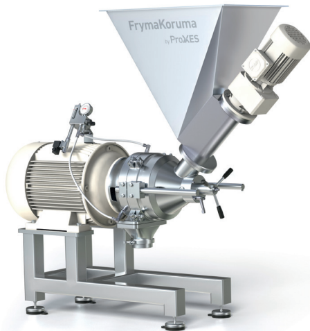
MZ 250 Variable wet milling

HEATING COOLING HOMOGENISING DEAERATION VACUUM GRINDING CUTTING MIXING