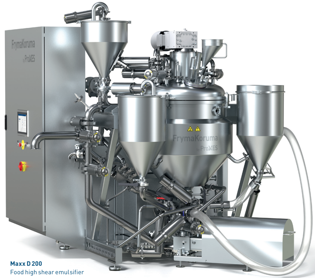
Maxx D 200 Food high shear emulsifier