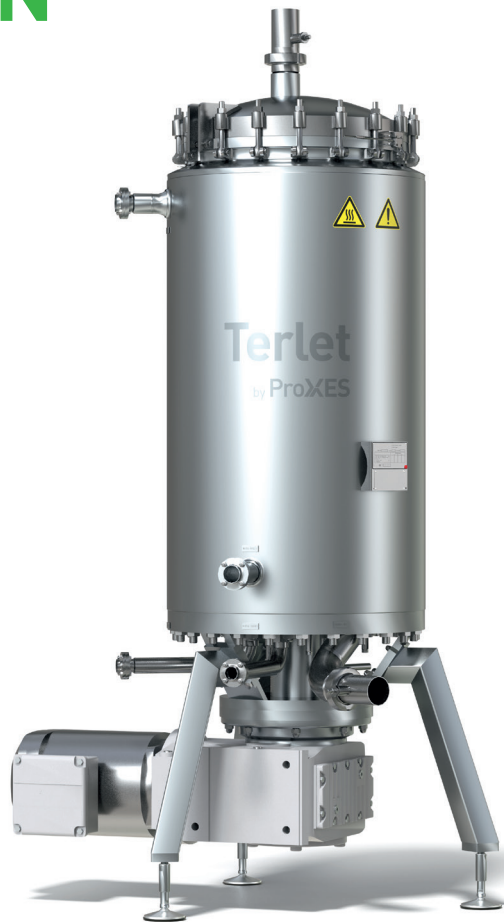
Terlotherm Continuous fast heat exchanger