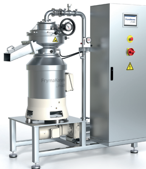
Corundum Stone Mill – MK Versatile wet milling & dispersing