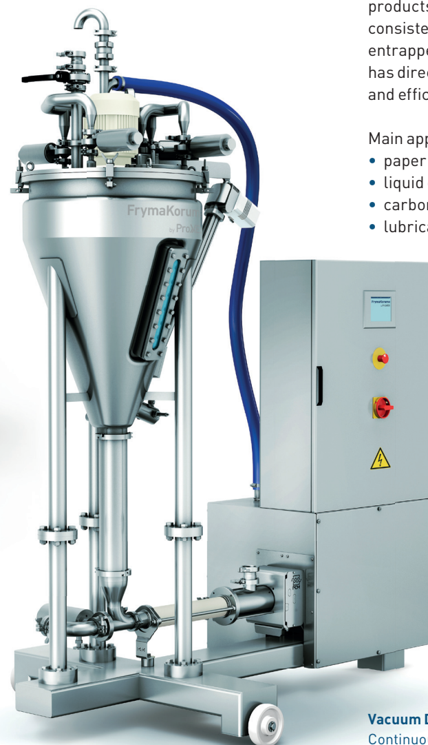
Vacuum Deaerator (VE) Continuous automatic removal of air