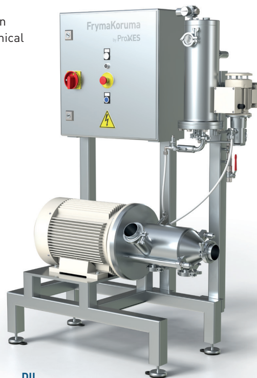
DIL Inline emulsifier

Illustrative purposes only. Actual machine construction may vary by specification.