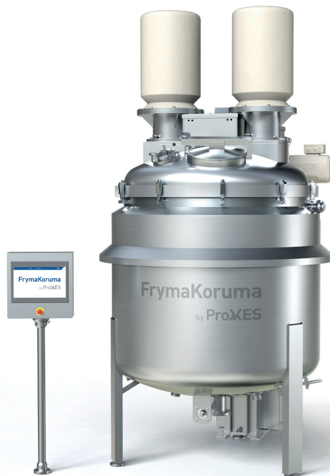
VME Universal mixing and dispersing

Illustrative purposes only. Actual machine construction may vary by specification.