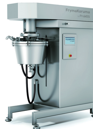
Co-Ball Mill – MS High energy grinding & dispersing